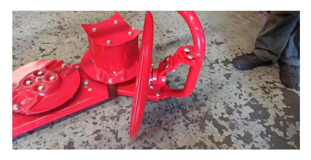
STEP 21 ASSEMBLY THE RIGHT SIDE DISC AS SHOWN