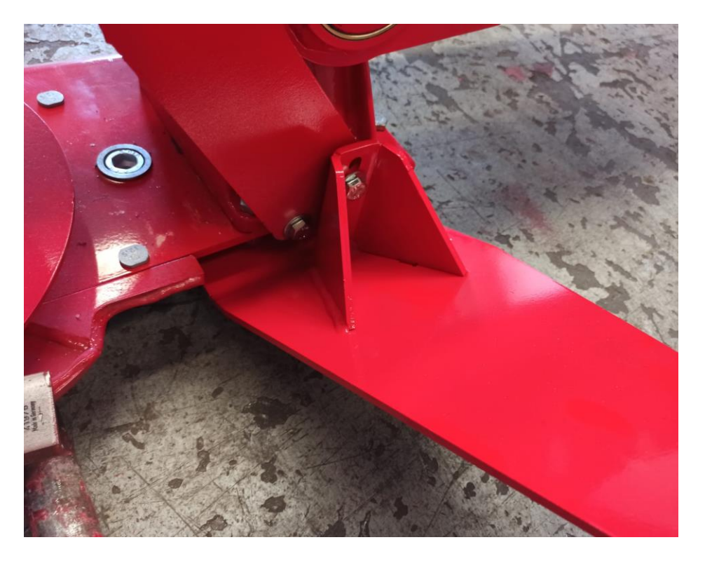
STEP 13 BIG SKID FRON CONNECTION