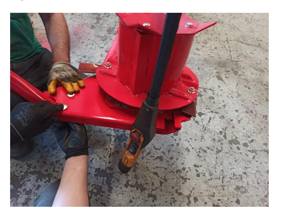
STEP 9 PLACE THE SUPPORT PIPE AT CONNECTION POINT