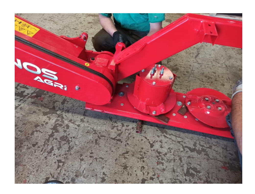
STEP 6 TIGHTEN CONNECTION BOLTS PROPERLY